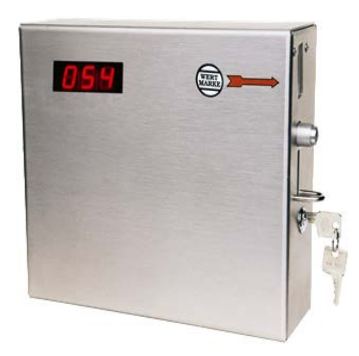
Stainless steel cases for coin or token-operated controls contribute to a long and trouble free service life.

Stainless steel is a good choice for coin or token-operated devices that control water or gas supplies. These machines are often used in wet humid environments like washrooms and should be easy to maintain.