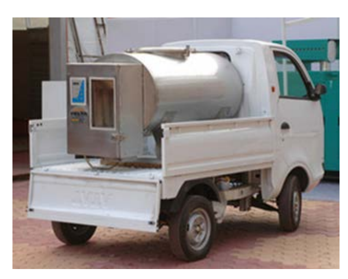
Mobile vending units are mounted to the delivery vehicles. The supply chain is tamper-proof.

milk in India, a farming company developed a novel system. Thermally insulated stainless steel mobile milk vending machines are mounted on vehicles. The tanks are filled with milk at the dairy and sealed with password protected digital locks to prevent tampering. The milk is dispensed at the customer's doorsteps through an automatic vending machine attached to the mobile tank.