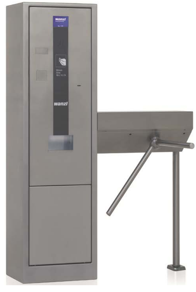
Ticket machines with turnstile for access control are often placed in humid environments – another reason to prefer stainless steel.