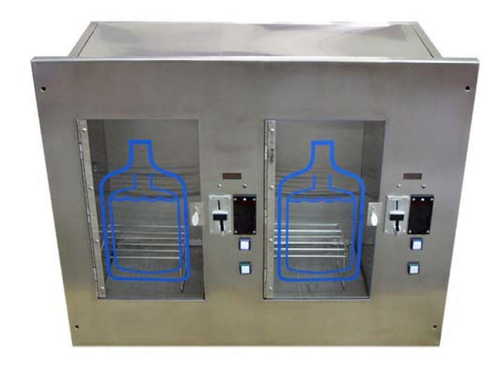
Wall Mounted Water Vending Machine

Stainless steel has an ideal profile and is available in many different suitable grades. The most common one is the classic chromium-nickel stainless steel 304. Its excellent weldability and formability facilitate fabrication. When cost is a concern, ferritic stainless steels are an option. They are essentially iron-chromium alloys. The lowest cost variant is 12 % chromium stainless. steel. Its corrosion resistance is lower than that of type 304: however it is an excellent choice when the bodies of the machines shall be painted. It does not require primers or other protective layers prior to coating, which simplifies manufacturing significantly. Chromiummanganese stainless steels of the 200 series are found in mechanical parts because of their high strength properties.