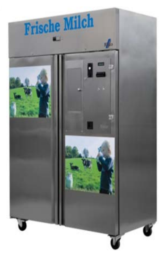
Bulk milk from vending machines is an economic and an environmentally friendly solution minimizing transport and packaging waste.