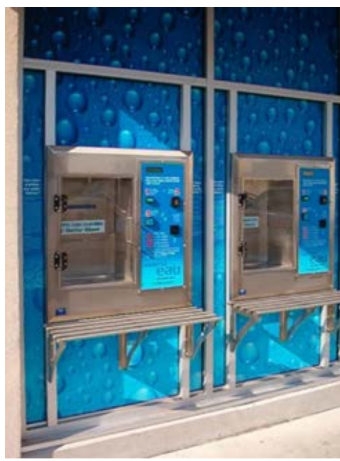
Filtration and disinfection reassure consumers that their water is of optimal quality.