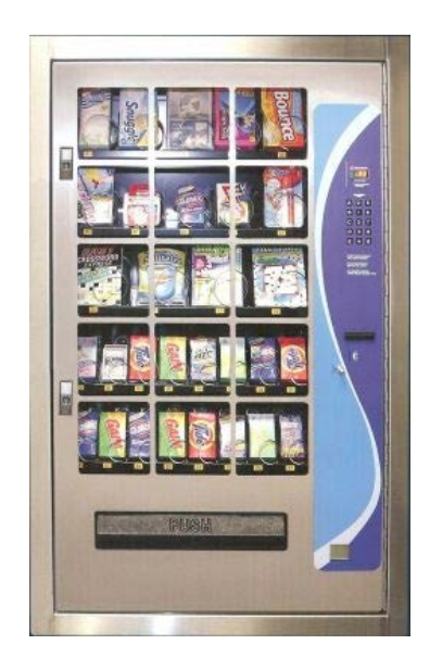
Stainless steel front door of a wall-mounted machine.

Stainless steel front panels have multiple functions: not only do they look good; they are also a safety feature. Austenitic stainless steel, when deformed under great pressure and at high speed, develops a phenomenon known as work hardening, i.e. its mechanical strength increases. As stainless steel doors are more difficult to break open than carbon steel doors of the same wall thickness, they are often used for machines containing valuable products or cash money that is attractive for burglars.