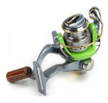
Fishing Spinning Reel.